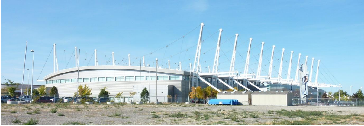
Olympic Oval, Salt Lake City, Utah.